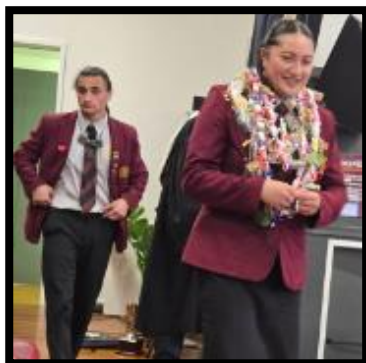
These are the 2024 Head Girl and Head Boy of Queen Elizabeth College

I was overwhelmed by the authentic celebration of all the students who were recognised at this event. The kaiako and whānau were so impressed with their tamariki's mahi and the pathways they had chosen for their futures.