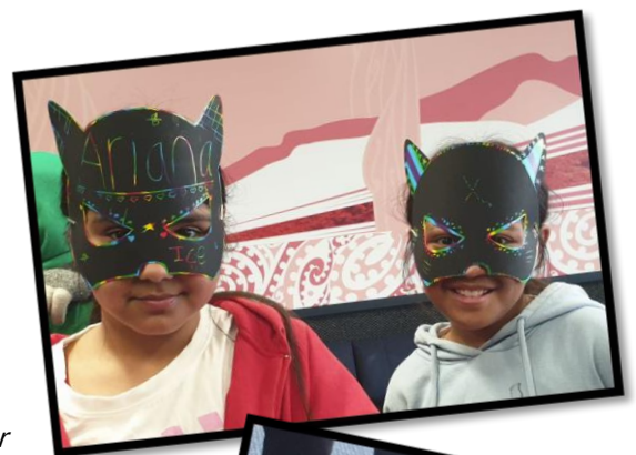
Room 2 & 6 had fun making colourful masks last week, making a mess with Oobleck, making marshmellow rice cake muffins and dancing at our Disco.