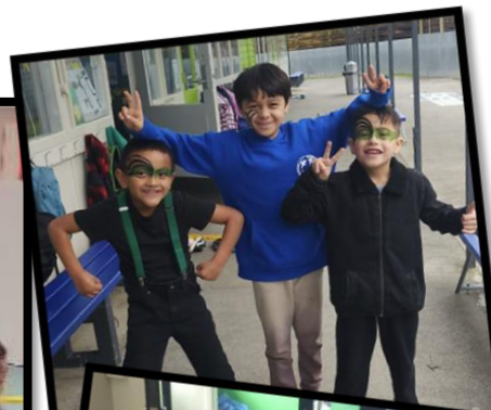
Ruma whitu Masks