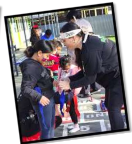
Wairautanga Day activities - The Olympics