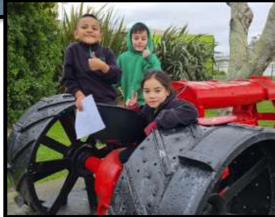
Fun on the tractor